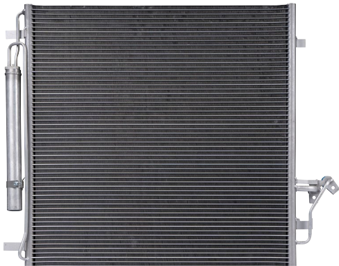
Part No: 30148 Replacement Condenser 2019-23 Ford Ranger 2.3L 4Cyl L