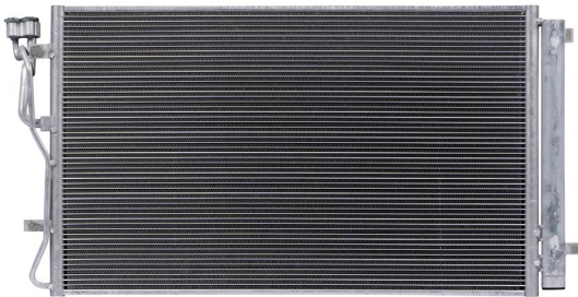
Part No: 30191 Replacement Condenser 2021 Kia Seltos 2.0L 4Cyl L