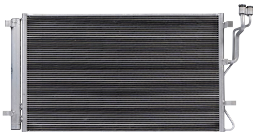
Part No: 30149 Replacement Condenser 2018-21 Hyundai Kona 2.0L 4Cyl L