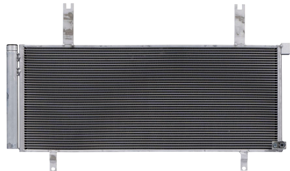
Part No: 30163 Replacement Condenser 2019-21 Honda Insight 1.5L 4Cyl L

Please visit www.oscautomotive.com for detailed applications or contact customer service for further information.